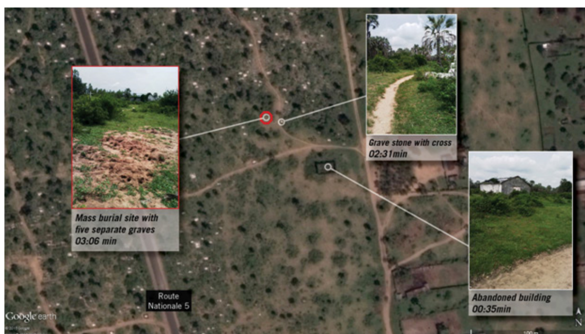
Figure 5. © DigitalGlobe/Google Earth. November 3, 2015. Graphic produced by author.

A shaky cell phone video of a desolated area was shared with Amnesty International. The short video did not reveal many reference points and ended with showing a small area of disturbed earth. A slow motion review of the video allowed analysts to extract crucial details: First, the video appeared to show five separate, small mounds. Second, the video included at least some geographic reference points, most notably an abandoned building, grave stones, and palm trees. Field and news reports suggested that one possible mass burial site was near Mpanda cemetery, to the north of the capital Bujumbura. A review of pre-event satellite imagery on Google Earth and other geographic databases eventually allowed pinpointing the exact location of the likely gravesite. Equipped with this new information extracted from the video and Google Earth, Amnesty International was able to commission analysis of new satellite imagery (Google Earth imagery normally does not provide the most current imagery. In this case, the available imagery was from prior to the event of interest).