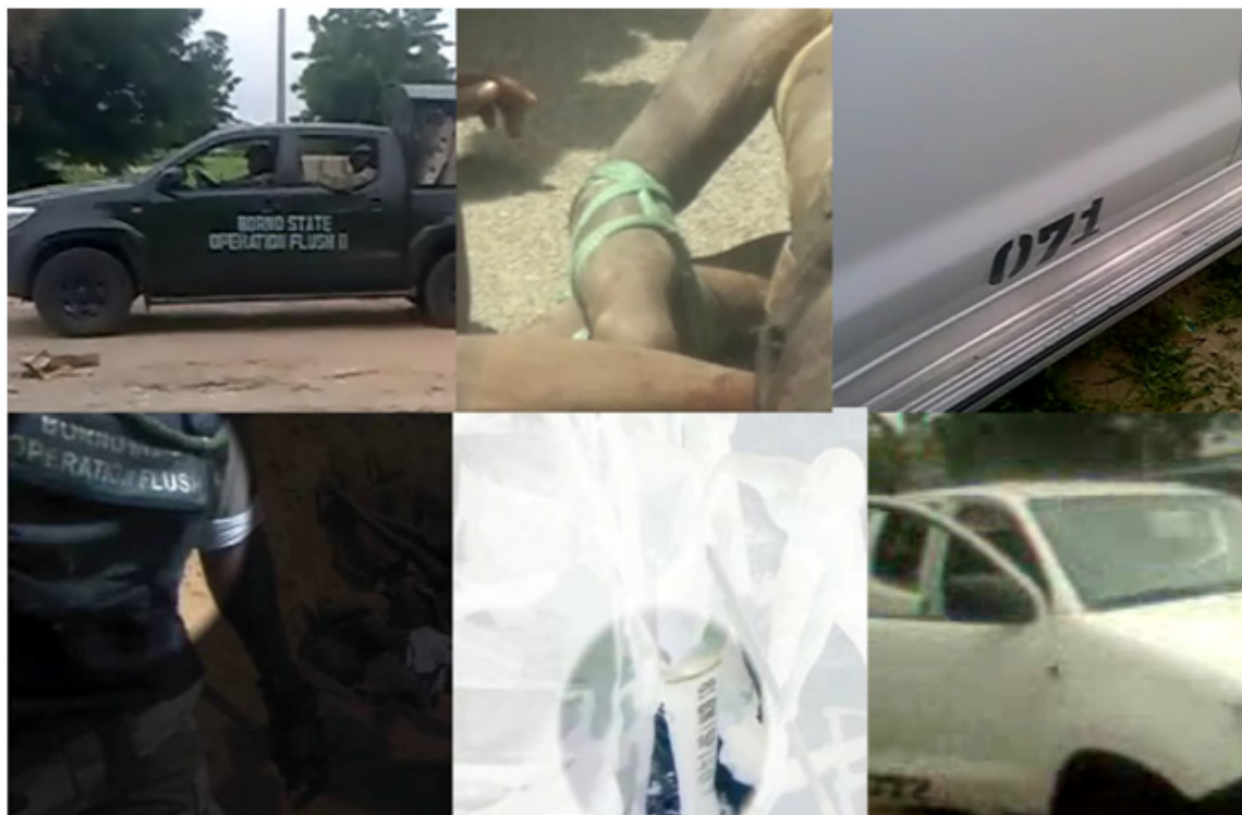
Figure 4. Some colors inverted using VLC Player, for enhancement purposes only. Graphic produced by author.

killed them, and threw their corpses in a river. Due to the clear geographic landmarks visible in the video (prison and bridge), it was possible to confirm the exact locations and reconstruct the event.